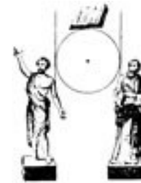
Here is its meaning!

In the February notice the quest was ask if you could identify this symbol. Hope you weren't thrown off by the statues and book.