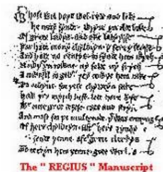
The " REGIUS " Manuscript

The Regius Manuscript is the oldest known version of English Masonic regulations yet to be discovered. This premier of the Old Charges, or pre-1717 documents of the regulations of the Craft, is also notable for being the only one written in verse. The poem was written before the advent of the printing press [1] , sometime between 1390 and 1450 A.D. While the 1390 date is most often cited, that is about the earliest possible date for it, and recent scholars puts it as more likely after 1425. It was written in a Middle English script, not Latin or Saxon or Old English, as sometimes misrepresented, though the headings were in Latin. It is barely recognizable today because it is in a Gothic or Germanic lettering style, and the alphabet and spellings have changed, but if sounded phonetically, most of the words are still understandable in our language of today. While the scribe may have been a literate mason, he was more likely a priest or monk commissioned by a local Operative Masonic lodge. Whoever he was, it has long been assumed that he was paraphrasing, and extending, an even older Masonic document no longer extant.